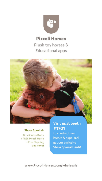
Your Show Directory Ad Here