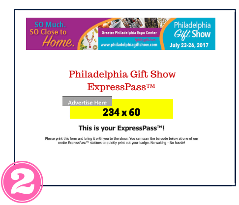
ExpressPass™ Email Confirmation