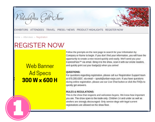
Registration Landing Page

Exclusive PRE-SHOW BRANDING opportunities