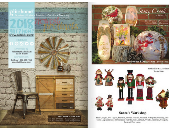
Your Product Preview Guide Ad Here