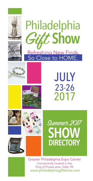
Show Directory Cover